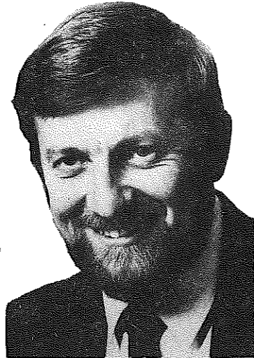
Senator The Hon. Gareth Evans, QC, Minister for Resources and Energy.

As an integral part of government's resources and energy portfolio, the Division of National Mapping (Natmap) has now been proudly satisfying the Commonwealth's mapping programs for many years.