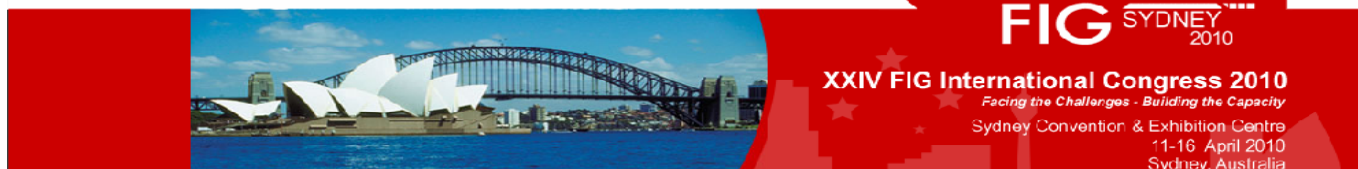
FIG SYDNEY 2010 XXIV FIG International Congress 2010 Facing the Challenges - Building the Capacity Sydney Convention & Exhibition Centre 11-16 April 2010 Sydney, Australia

With over 900 papers (both peer reviewed and non-peer reviewed) this Congress will have the largest technical program in FIG history.